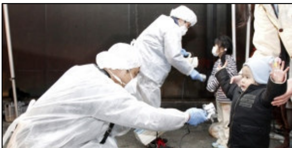
Children tested for radiation near Fukushima Daiichi nuclear plant.