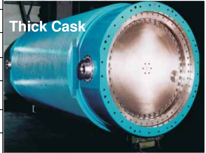
CASTOR® - Type V/19 cask

The NRC ignores critical American engineering standards (ASME N3). They allow canisters that cannot be inspected, repaired or maintained.